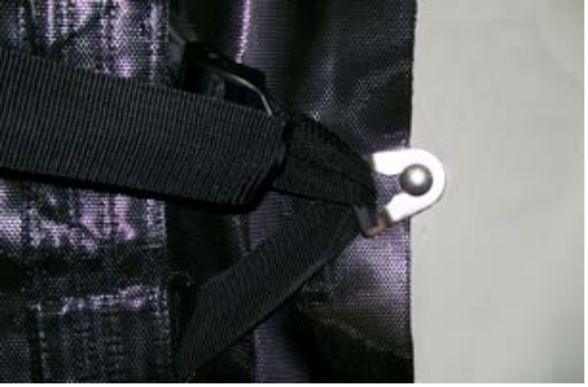
Repeat this process until the strap is tight. The screen should still have some play after tightening